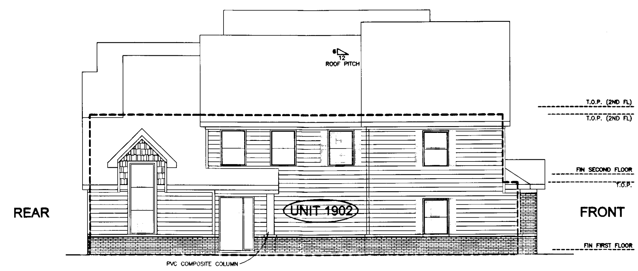
LEFT SIDE ELEVATION 1/8" = 1'-0"