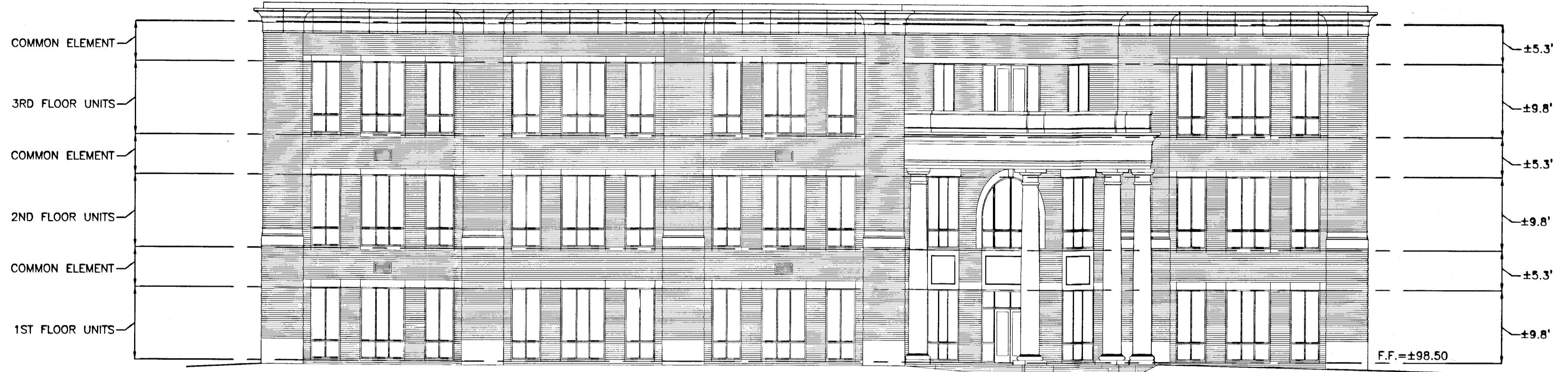
BUILDING ELEVATION SCALE 1"=10'