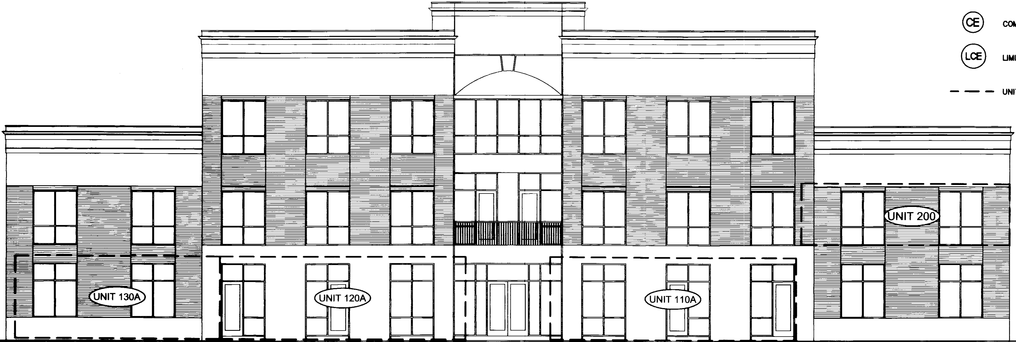
REAR ELEVATION (PARKING LOT)

⊙ CE COMMON ELEMENT ⊙ LCE LIMITED COMMON ELEMENT - - - UNIT BOUNDARY