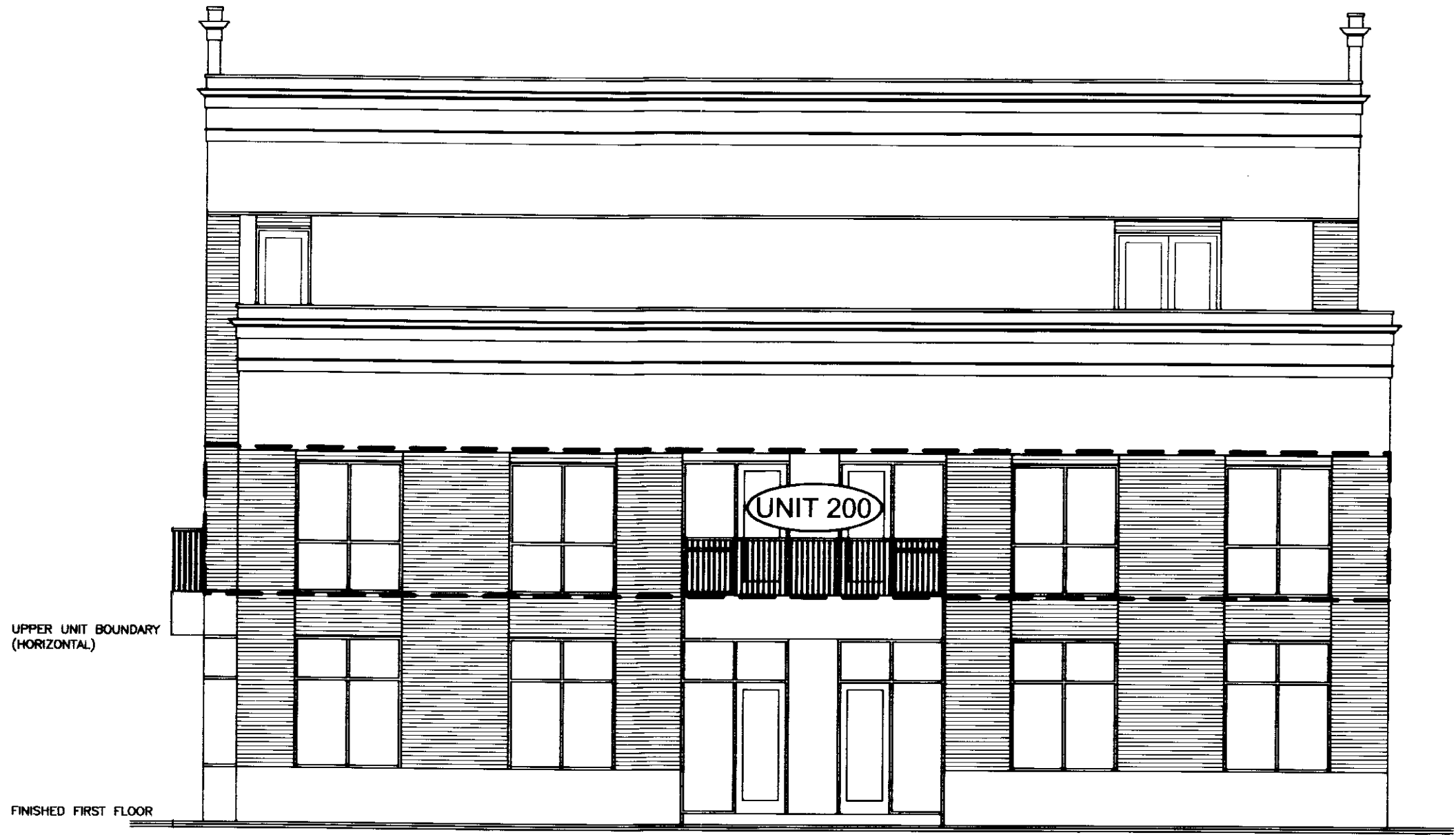
LEFT SIDE ELEVATION NOT TO SCALE