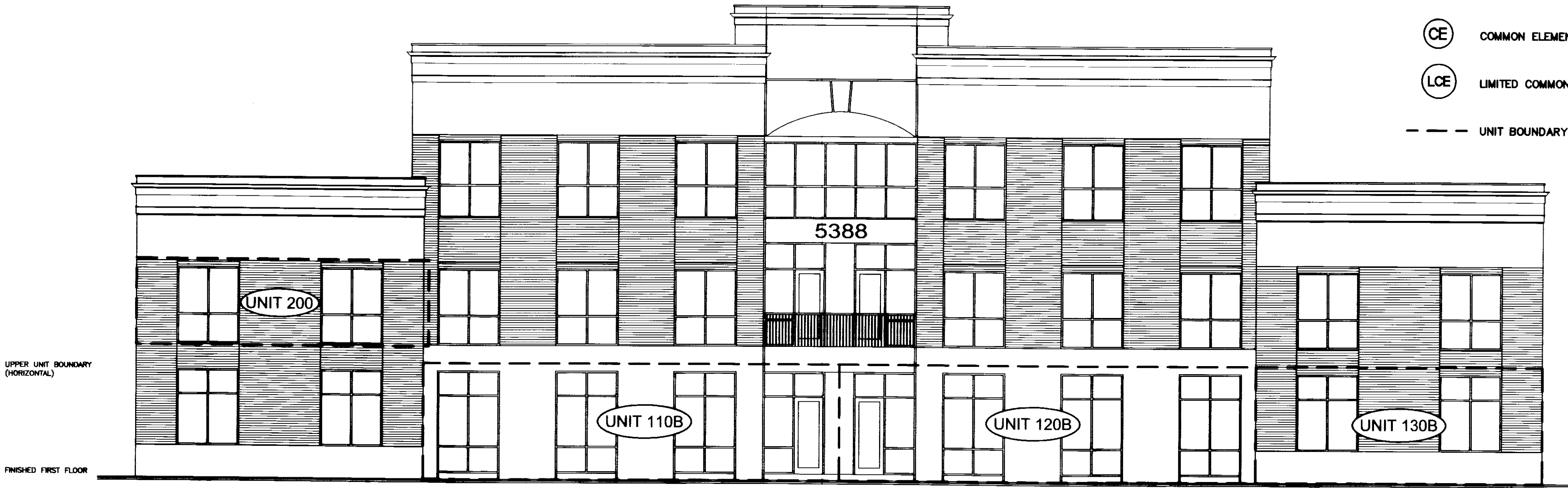
FRONT ELEVATION (DISCOVERY PARK BLVD.) NOT TO SCALE

⊙ CE COMMON ELEMENT ⊙ LCE LIMITED COMMON ELEMENT - - - UNIT BOUNDARY