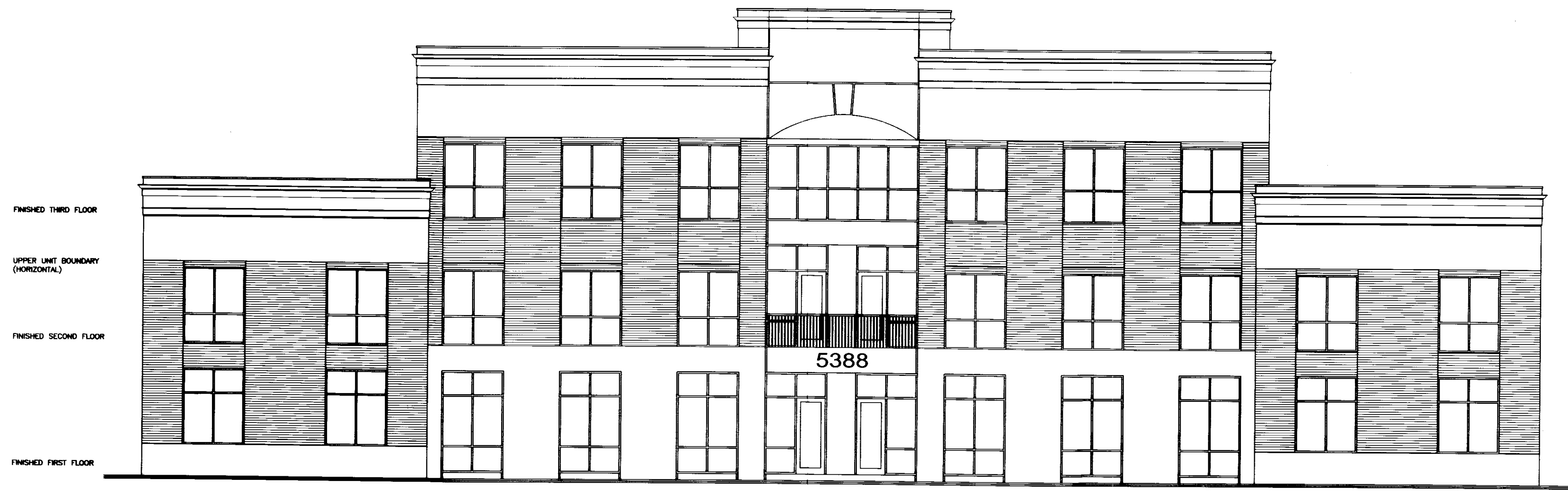
FRONT ELEVATION (DISCOVERY PARK BLVD.)