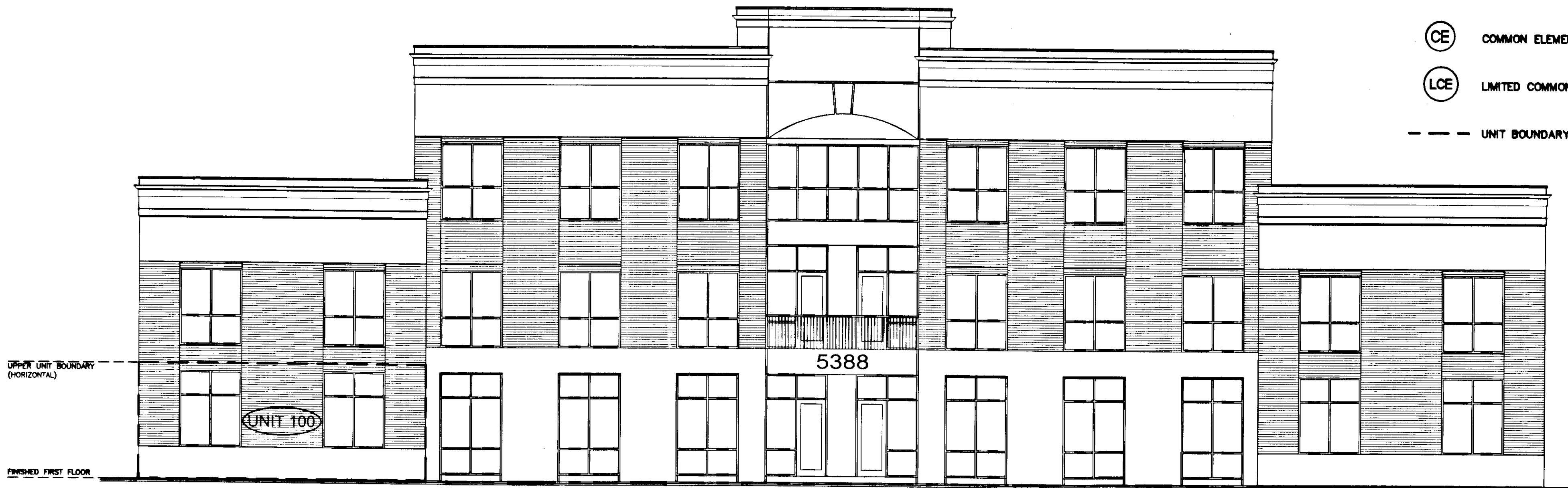
FRONT ELEVATION (DISCOVERY PARK BLVD.)

⊙ CE COMMON ELEMENT ⊙ LCE LIMITED COMMON ELEMENT - - - UNIT BOUNDARY