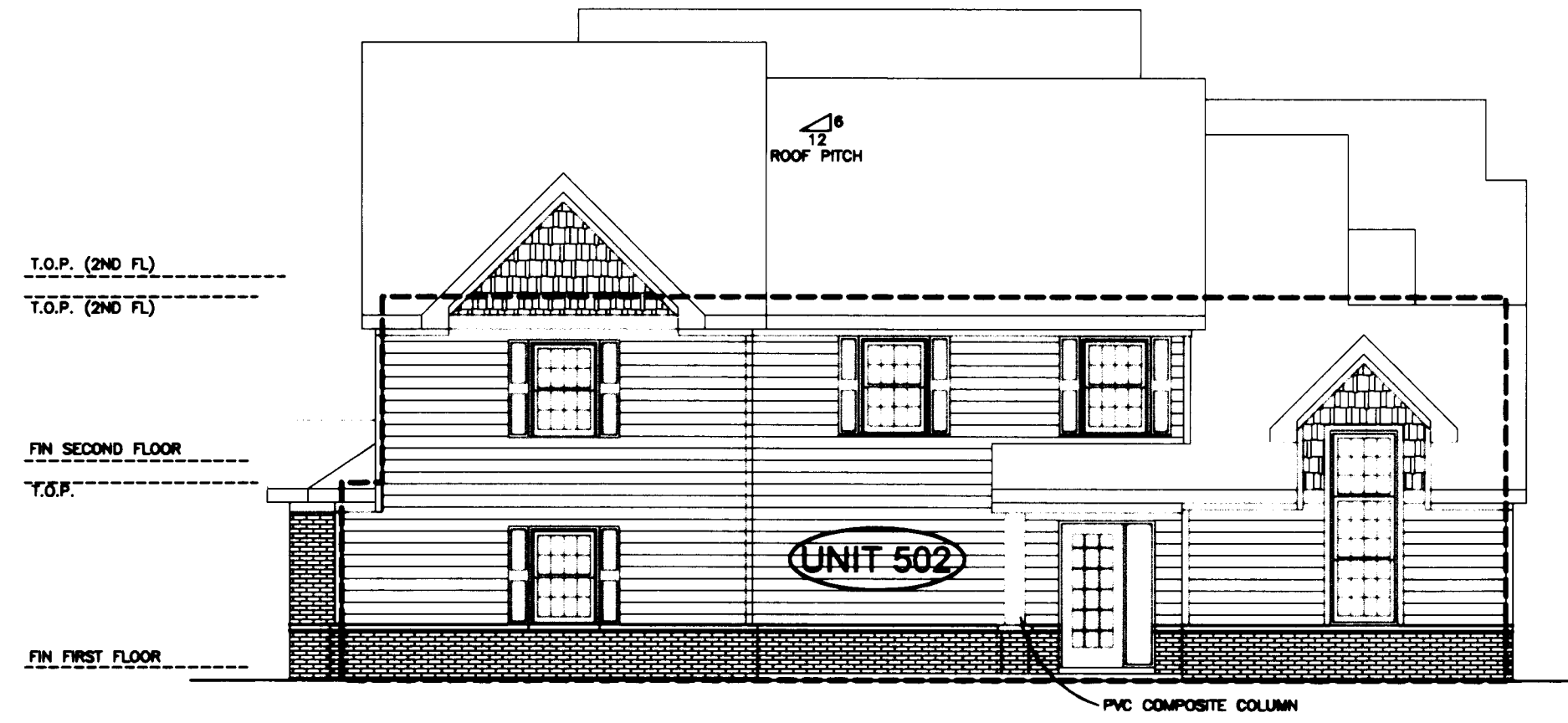
RIGHT SIDE ELEVATION- MODEL B (UNIT 502) 1/8" = 1'-0"