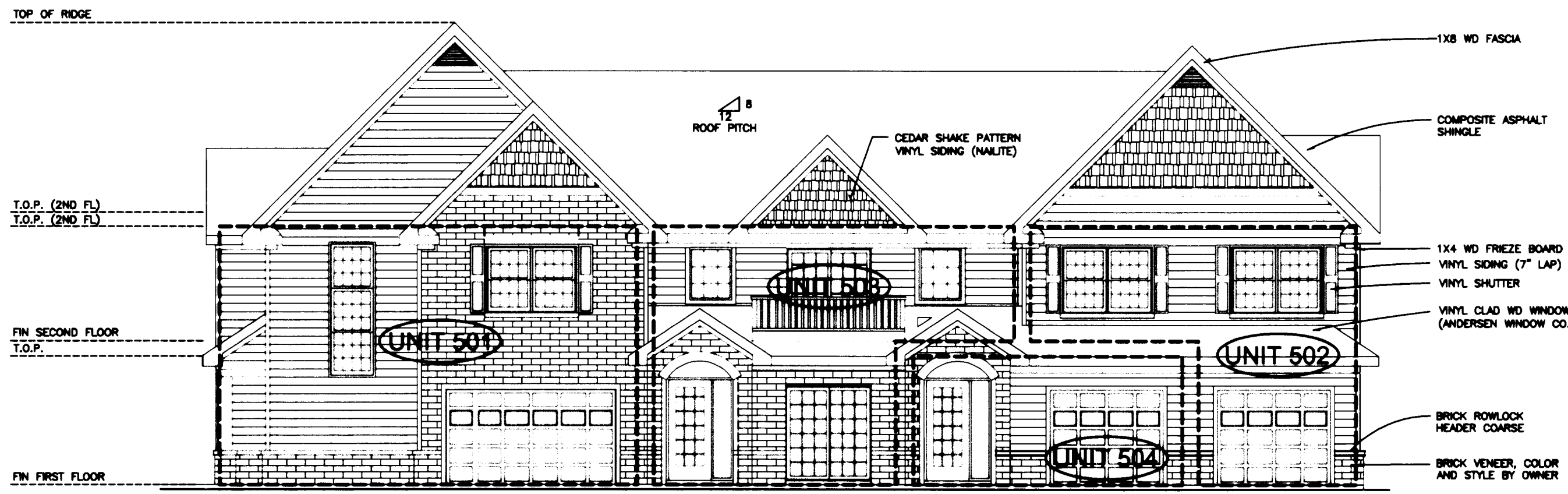
FRONT ELEVATION 1/8" = 1'-0"