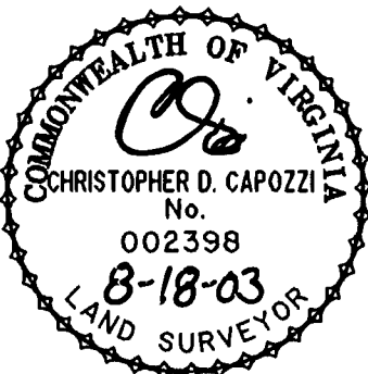
EXHIBIT "A" CLAIBORNE (A CONDOMINIUM COMMUNITY) PHASE SEVENTEEN