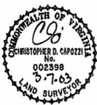
EXHIBIT "A" CLAIBORNE (A CONDOMINIUM COMMUNITY) PHASE TWELVE