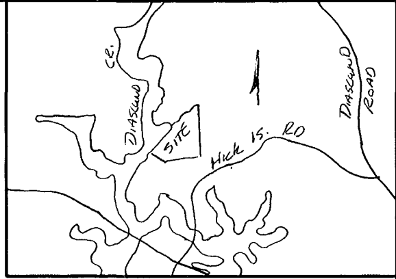
VICINITY MAP 1" = 2000'