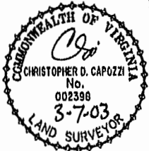
EXHIBIT "A" PHASE 15 FAIRWAYS VILLAS AT GREENSPRINGS, A CONDOMINIUM FOR GREENSPRINGS DEVELOPMENT, L.C. BERKELEY DISTRICT JAMES CITY COUNTY, VIRGINIA

COMMON AREA BMP LAKE # 1 AREA = 38,082 SQ. FT. = 0.8735 AC. SEE SHEET 3 FOR DETAIL