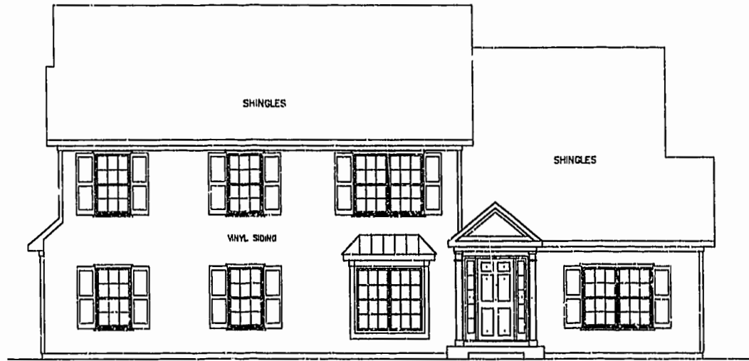
RIGHT ELEVATION NOT TO SCALE