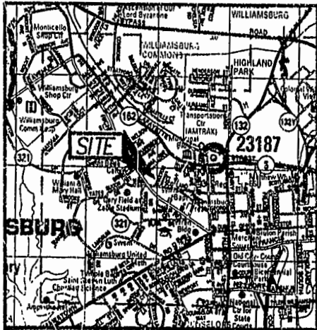
VICINITY MAP SCALE: 1"=2000'

SURVEY OF A PORTION OF LOT 2 AS SHOWN ON PLAT ENTITLED "PROPERTY OF RH. BRAXTON" WILLIAMSBURG, VIRGINIA FOR WILLIAMSBURG REDEVELOPMENT & HOUSING AUTHORITY