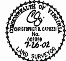
EXHIBIT "A" PHASE 26 FAIRWAYS VILLAS AT GREENSPRINGS, A CONDOMINIUM FOR GREENSPRINGS DEVELOPMENT, L.C. BERKELEY DISTRICT JAMES CITY COUNTY, VIRGINIA