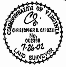
EXHIBIT "A" PHASE 26 FAIRWAYS VILLAS AT GREENSPRINGS, A CONDOMINIUM FOR GREENSPRINGS DEVELOPMENT, L.C. BERKELEY DISTRICT JAMES CITY COUNTY, VIRGINIA