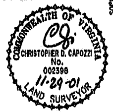
EXHIBIT "A" PHASE 34 FAIRWAYS VILLAS AT GREENSPRINGS, A CONDOMINIUM FOR GREENSPRINGS DEVELOPMENT, L.C. BERKELEY DISTRICT JAMES CITY COUNTY, VIRGINIA